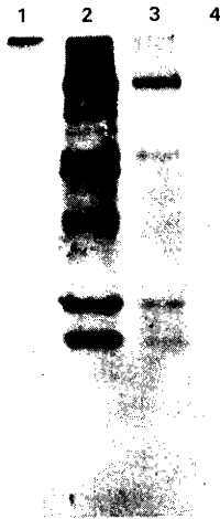
Fig. 2. Slab gel of peroxisomal precursor proteins isolated from microsomes. Rats were injected in the portal vein with 0.5 mCi [ ^{35}\text{S} ]methionine and 0.5 mCi [ ^{35}\text{S} ]cysteine and the liver was removed after 5, 45, 90, or 180 min (lanes 1, 2, 3 and 4, respectively). Microsomes were precipitated with antibodies against peroxisomal membrane protein. The figure shows the result after autoradiography.

incorporation of this label into total phospholipid was followed (Fig. 3). Peak incorporation into microsomes occurred at 30 min followed by a rapid decay. As expected, the specific radioactivity in total peroxisomal phospholipid was lower at this time but increased continuously during the first two hour period. Since peroxisomes are considered to lack an enzyme system for synthesis of phospholipids, the experiments indicate relatively rapid transfer of lipids from endoplasmic membranes to peroxisomes.