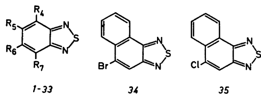
Table 1. Benzo-2,1,3-thiadiazoles ( 1-35 ).